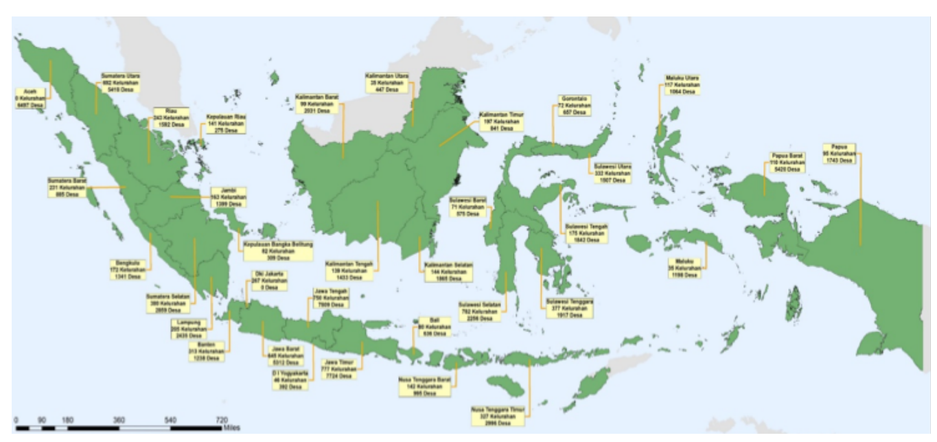
Figure 1: Distribution of Urban Village and Village Administration Status (2017)